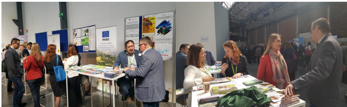
Participation of BRDN at the Marketplace stand