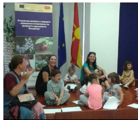
Akt 1_1_TravelingExhibition_EU Info Center – creative workshop with children from SPIRIT kindergarten at the opening of the travelling exhibition at the EU InfoCentre in Skopje (18/05/2015)

Field activities of GREET THE BIRDS OF ILINSKA PLAKENSKA MOUNTAIN project officially started on 18 April. This project is supported by the Macedonian Environment Society – MED and Euronatur from Germany. The main goal of this project is promotion of biodiversity by identifying and learning about the birds and their habitats in the area of Ilinska-Plakenska Mountain and the Belchansko wetlands (the Municipality of Demir Hisar). The aim of the project is to raise the awareness of the local population and tourists about the birds and their significance for the countryside in the region. In addition, this project will support bird monitoring activities in Macedonia and the process of establishing a NATURA 2000 area.