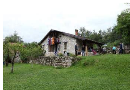
Akt 3_Poseta na APG_Otvoreno studio – atmosphere at the beginning of the Open Studio event