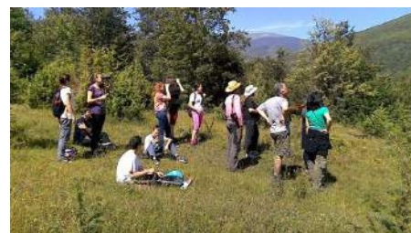
Akt 2_Monitoring of the birds – A group of volunteers together with artists and experts at field monitoring of birds in the vicinity of the Village of Sloeshnica